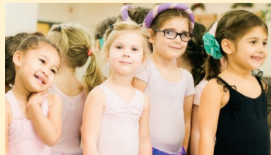
MBA Children's Camp participants 2017